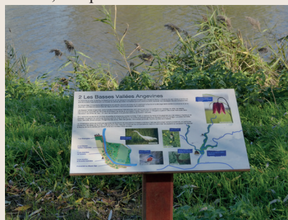
Discovery trail in the « Basses Vallées Angevines »

to the prosperity of the village. These wooden river boats were over 30 metres long and were used to transport cereals, stones, hemp and wine to the Loire.