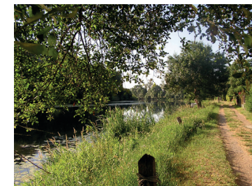
Banks of the river Sarthe